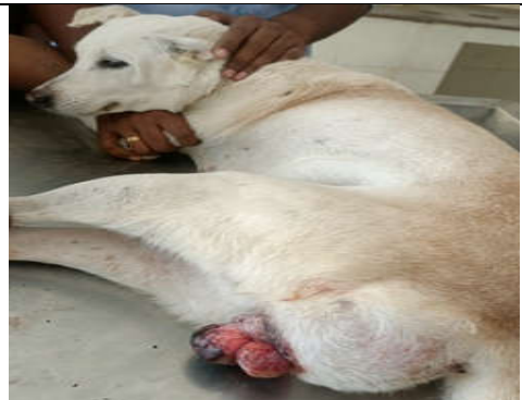
Fig.2 : Swelling of the perineal region of the bitch (Arrow).