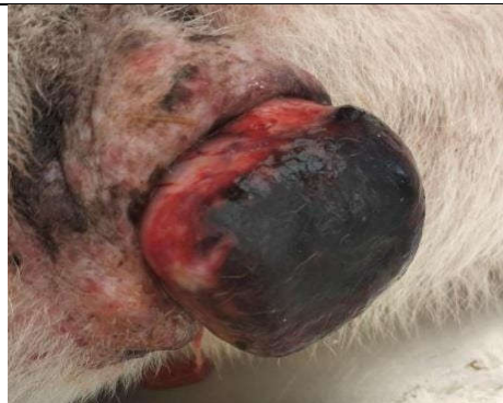
Fig.1: Reddish mass protruded from the vulva of female dog.

clamped using artery forceps while large blood vessels were ligated. Multiple tumour growths of various size which were round to oval in shape were excised carefully by incising the capsule (Fig 4). The size of tumour growths varied between 1 to 12cm in diameter. All these growths were recovered from dorsal wall of vagina. The incision site was closed by opposing the vaginal mucosa using chromic cat gut. size 1-0 by following simple continuous suture pattern. The skin was closed routinely and the animal was administered with antibiotic Inj.Ceftriaxone with Tazobactam (@20mg/Kg B.wt) and Inj.Tramadol (@3mg/Kg B.wt) intravenously for 5 days. The animal recovered and sutures were removed after 10 days of surgery. No recurrence reported even after nine months. The samples of masses were sent for histopathology for further confirmation of tumour.