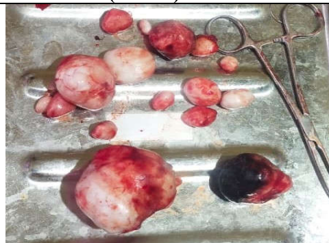
Fig.5: Tumour masses of various sizes removed after surgery