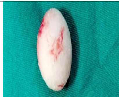
Figure 4 Large oval cystolith with surface porosity

Infrequent urination as a result of confinement, lack of regular exercise, urine retention for more than 24 hrs, becomes alkaline due to release of ammonia from breakdown of urea. Reduced water intake, high levels of minerals in diet and excess protein may also contribute to the disease. Dogs must be fed with diets that lower urinary phosphate and magnesium and maintain acidic urine as also recorded by Uma et al. , 2018. In this case, there was no reoccurrence for a period of 6 months. Following surgical intervention proper general and dietary management is required to prevent reoccurrence of cystolith as also recommended by Uma et al. , 2018. In the present cases, the biochemical analysis of the cystic calculus by Fourier Transform Infrared Spectroscopy (FTIR) revealed that it was made up of calcium oxalate salts. In the present case, the biochemical analysis of the cystic calculi in both the cases revealed that it was made up of calcium oxalate salts which may be due to usage of hard water by both the bitches. The incidence of obstructive urethral urolithiasis was more common in adult castrated male dogs where as cystic calculi was more common in female dogs as also reported by Njoku et al. , 2021. Older dogs