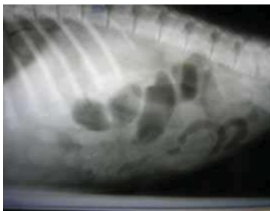
Fig[1].Gas filled intestinal loops

It was decided to perform the exploratory laparotomy as there was complete intestinal obstruction.